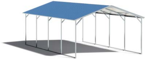
Includes 6" overhang on all sides