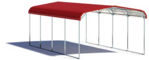
Includes 6" overhang on front & back