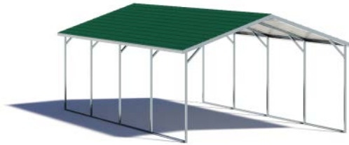
Includes 6" overhang on all sides