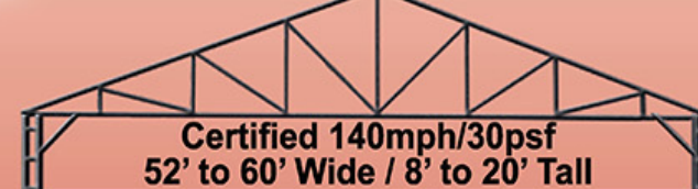
Certified 140mph/30psf 52' to 60' Wide / 8' to 20' Tall