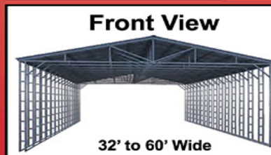
32' to 60' Wide