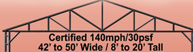
Certified 140mph/30psf 42' to 50' Wide / 8' to 20' Tall