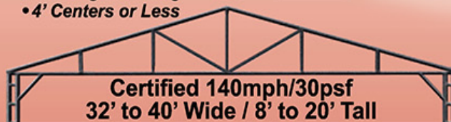
Certified 140mph/30psf 32' to 40' Wide / 8' to 20' Tall